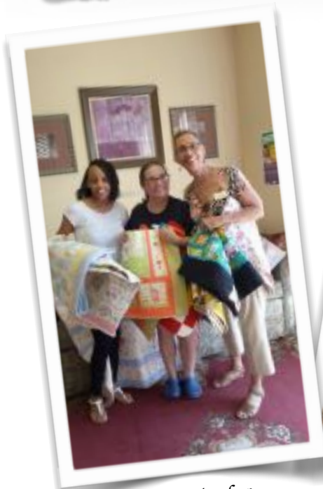
More quilts for Family Outreach (we received a really nice thank you letter from them. See page 5)