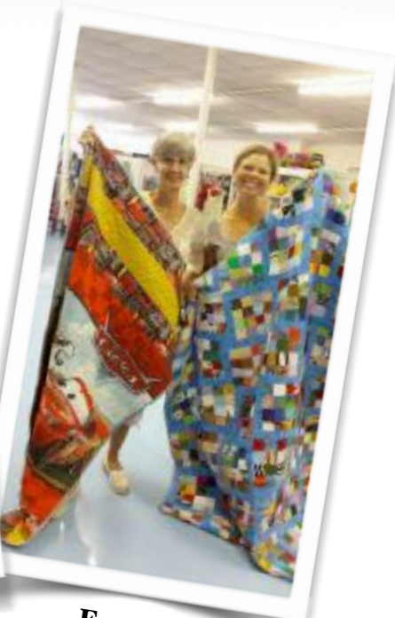
Fostering Hope They are always so appreciative of all the beautiful quilts we deliver to them.