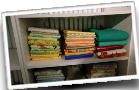
Organizing the fabric in the storage unit.