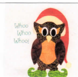
WHOO, WHOO, WHOO—8.50