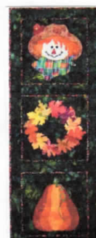
IT'S FALL Y'ALL---10.00