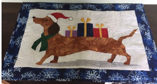
Doxie Christmas wall hanging - 27" x 17" - and the label that will be sewn on the back.