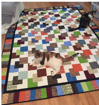
Hanky Panky - (cat approved).

These are the first PHD pictures that have been submitted.